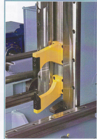
fixed fence moveable hooks